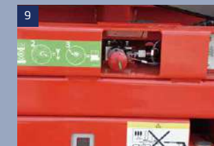
Manual lowering valve: When the operation system failed or the battery power is too low to let the platform decline, we can use this valve to lower the machine