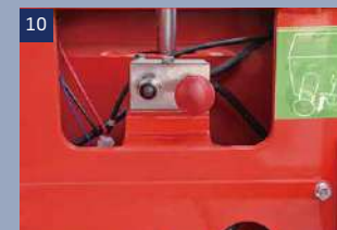
Manual release valve: When the machine can not move, you can push the machine after pressing this valve