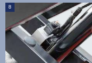
Explosion proof valve: To prevent the machine falling when the oil pipe is leaking