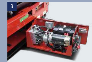
Hydraulic and electric system