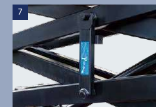
Supporting arms: To protect the operator when he is doing repair or maintenance job