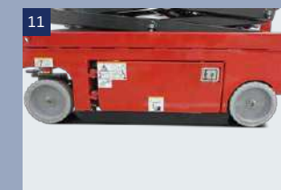
Anti-overturning system: When the machine raises to more than 2m, this system will work automatically, to protect the machine from overturning while walking at un-leveling ground