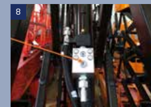
Explosion proof valve: To prevent the machine falling when the oil pipe is leaking