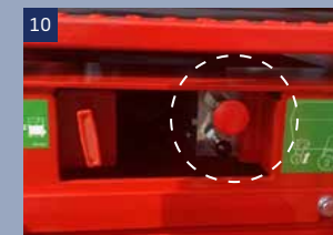
Manual release valve: When the machine can not move, you can push the machine after pressing this valve