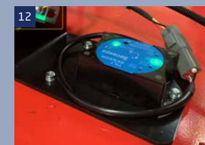
Angle sensor: when it is lifting and walking on the slope, the sensor will automatically judge the status of the machine, if the angle is larger than the rated angle, it will alarm to remind the operator.