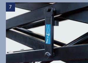
Supporting arms: To protect the operator when he is doing repair or maintenance job