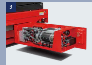
Hydraulic and electric system