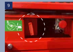
Manual lowering valve: When the operation system failed or the battery power is too low to let the platform decline, we can use this valve to lower the machine